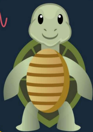
The Eco Warrior

We're on a mission to keep the planet healthy and to do this, we've asked Enzo to help. Being our trusty Eco Warrior, Enzo is here to tell you everything you need to know about sustainability and what makes a uniform 'eco'.